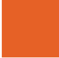
Orange - ORG